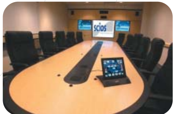
Scios, Inc. 4,000 sf Corporate Office Center including Executive Boardroom. Sunnyvale, CA