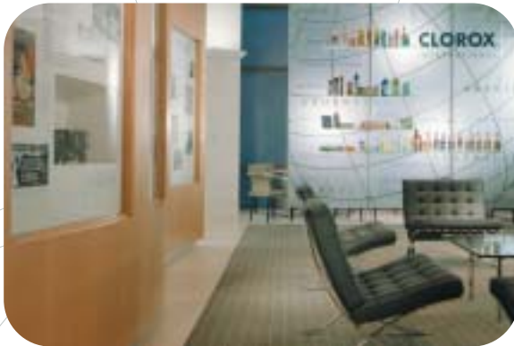
The Clorox Company 170,000 sf Capital Improvement Project including Corporate Headquarters Reception Lobby and Product Display. Oakland, CA