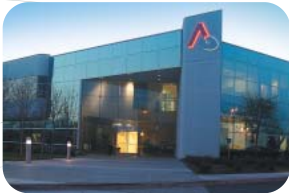
Abgenix, Inc. 100,000 sf Clinical Manufacturing Facility including Dual Cell Culture Trains and Fill and Finish Suite. Fremont, CA

As your project moves from design and permitting into the construction phase, our services include managing the bid reviews and selection; managing the architect, contractor and construction process; reviewing the construction documentation process; assisting the contractor with scheduling, budget control and procurement of long lead items; assisting you with quality control implementation and with your direct service vendors (i.e. furniture providers/installers, security personnel, tele/data providers, etc.); coordinating established commissioning, start-up and validation procedures, and providing coordination on project close-out, document turnover and final occupancy documentation.