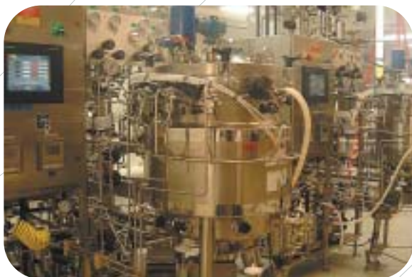
Abgenix, Inc. 36,000 sf Pilot Plant. Fremont, CA